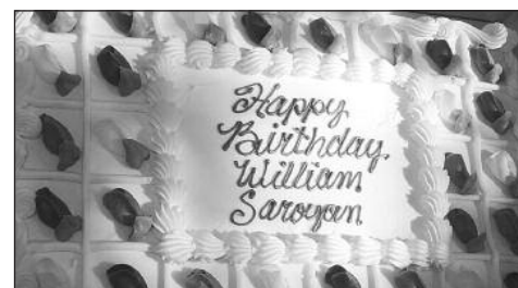
Society members enthusiastically served William Saroyan Elementary School students birthday cake.

staff went into warp speed motion to serve 630 kids their treat. William Saroyan never experienced a birthday celebration of this magnitude in his lifetime. The kids sent a message of thanks, and the Society volunteers gained an added level of appreciation of the daily duties of school teachers.